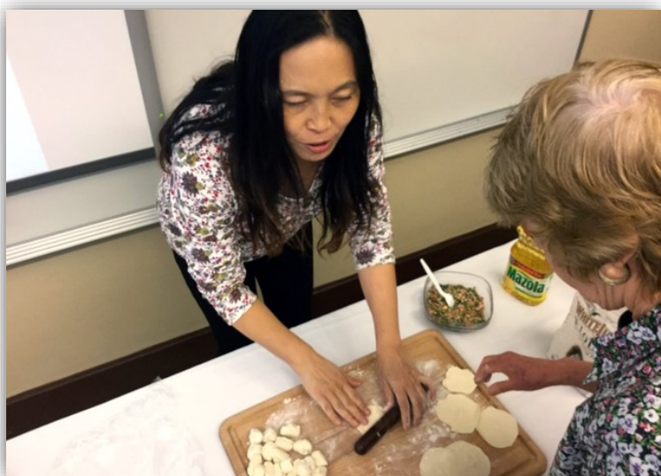
Chinese Cooking Class

From art and science; cooking and learning more about our natural environment. WALL members got busy during the Winter/Spring Semester.