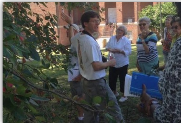
Plants and Shrubs