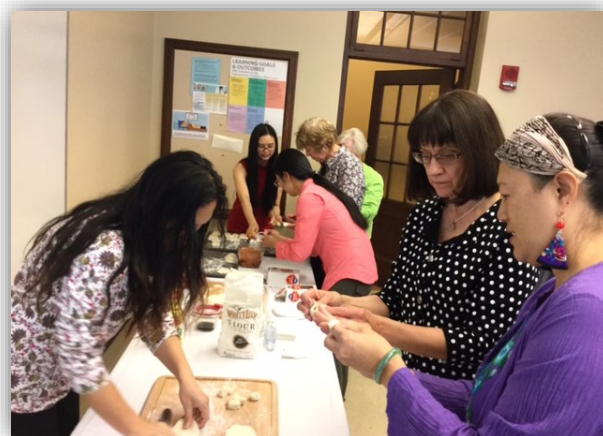
Chinese Cooking Hands-on