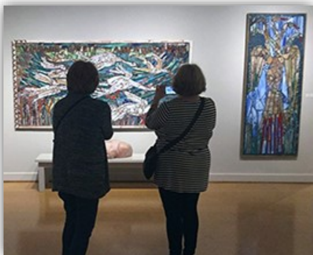
Artistic Field Trip