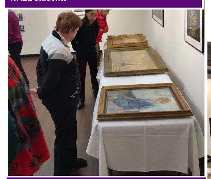
Exploring Impressionism in Wesleyan Art Collection

Wesleyan College offers so much to our WALL members and to the community at large. Many events on campus are open to the public (most are free of charge).