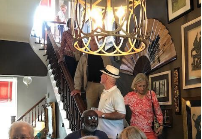
Touring Macon Homes is always popular with WALL students